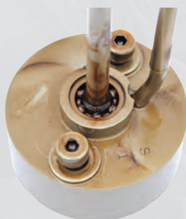
AMSOIL SYNTHETIC MULTI-VISCOSITY HYDRAULIC OIL (ISO 46)

Excessive oxidation results in harmful deposits and varnish that cause a host of problems, including stuck valves and decreased efficiency. In severe oxidation testing, AMSOIL Synthetic Multi-Viscosity Hydraulic Oil resisted elevated heat and oxidation more effectively than the conventional fluid.