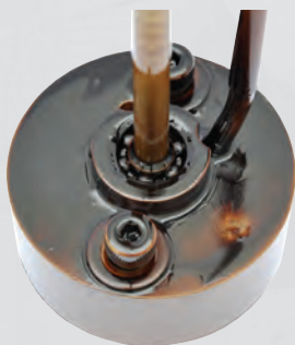
LEADING CONVENTIONAL HYDRAULIC FLUID (ISO 46)